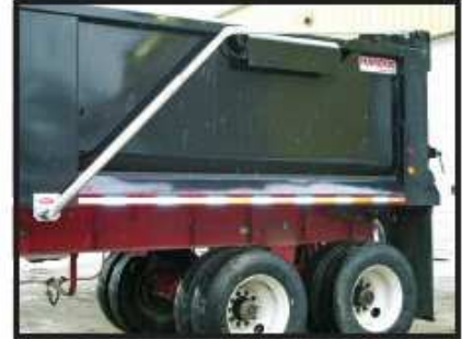
Custom Arms For High Lift Gates