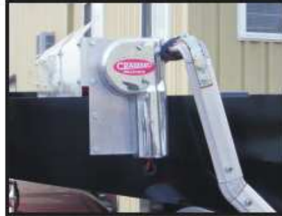
Bent Upper Arms For Trucks