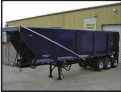
Straight Arms For Trailers